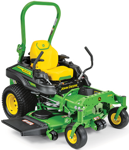
Z960M ZTrak™ Mower

Quote ID :29013627Customer Name : CITY OF LEBANON