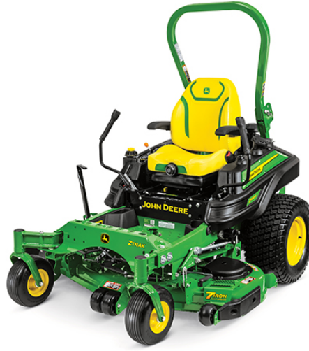
Z930R ZTrak Mower

Base Equipment On: Z915E, Z920M, Z930M, Z945M EFI, Z950M, Z955M EFI, Z960M, Z930R, Z950R, Z955R EFI, Z970R E and M Series 3-year, 1200-hour bumper-to-bumper warranty