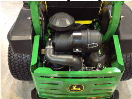
Z950M and Z950R engine