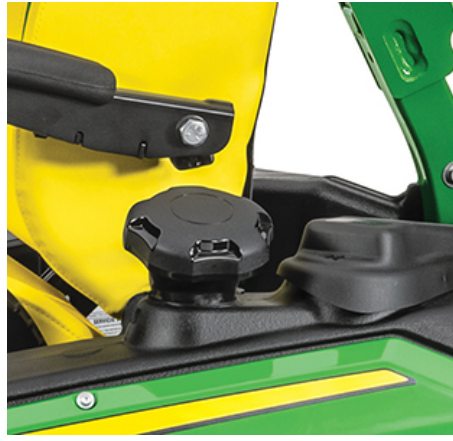
Fuel filler neck