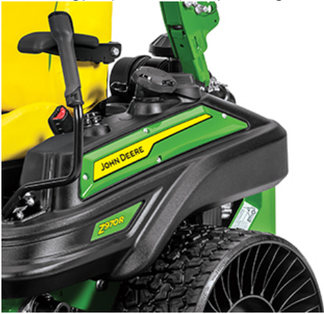
Fuel tank and filler neck

Under normal conditions, load, and operation, fuel consumption for the Z900 ZTrak Mowers is 1.5 U.S. gph (5.7 L/hr) to 2.2 U.S. gph (8.3 L/hr), depending on the horsepower and conditions.