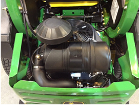
Engine air cleaner

Quote ID :29013627Customer Name : CITY OF LEBANON